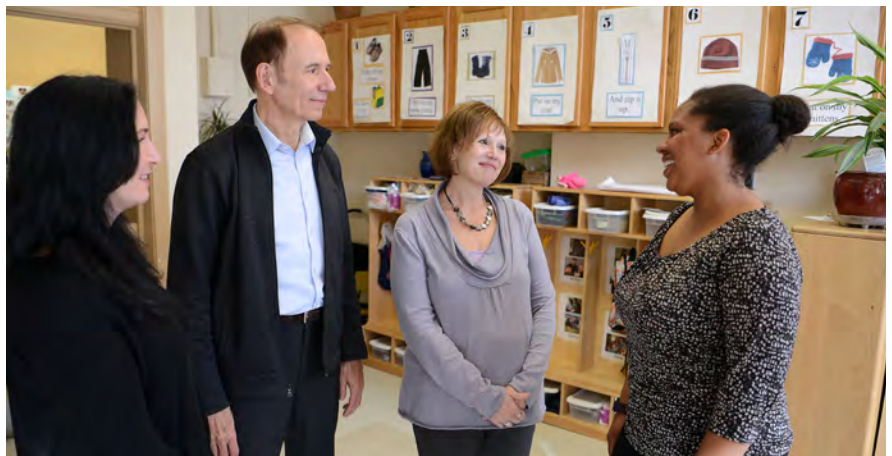
▲ Reflective supervision can be used in numerous situations—home visiting, intervention, social work, child protection, and public health.

of reflective supervision and build practitioners’ skills,” Ottman says. “Unlike other professional development tools, reflective supervision is a practice one never reaches